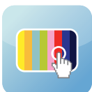
Color Touch Screen