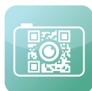
Camera (Support barcode Scanning)