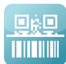
1D/2D Barcode Scanner Option