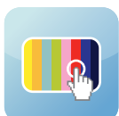
Color Touch Screen