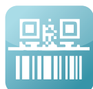
1D/2D Barcode Scanner Option