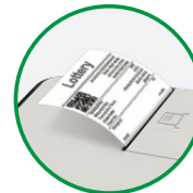
Integrated fast thermal printer with easy-loading mechanism