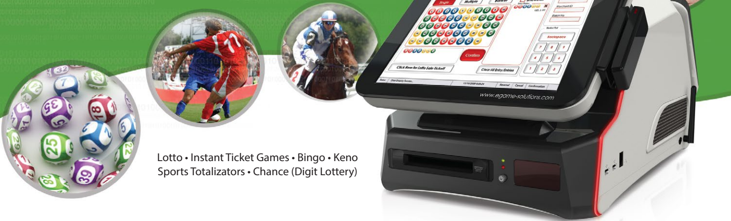
Lotto • Instant Ticket Games • Bingo • Keno Sports Totalizators • Chance (Digit Lottery)

LottoCat can be integrated to eGame proprietary lottery system - M.Lottery or other third-party lottery systems via various communication protocols for secured lottery transactions. Designed for counter-top and heavy-duty configuration, it is ideal for lottery retailers in fixed locations like betting centers, supermarkets, convenience stores, banks or post offices.