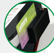
Optional integrated Magnetic Card, Smart Card and Contactless Card Reader