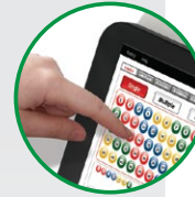
LCD Touch Panel and Optional Customer Display